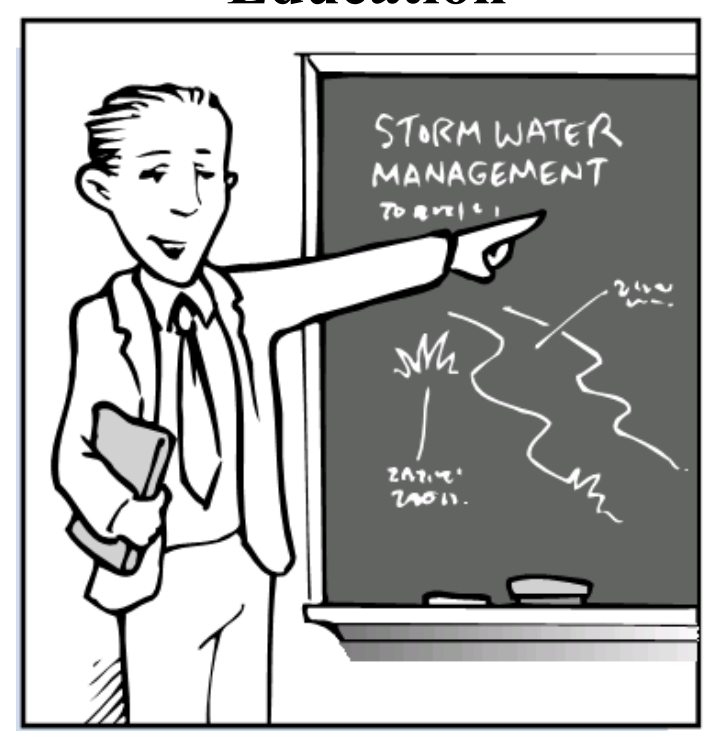
Hands In for Healthy Streams is a cooperative effort between the City of Buford and the local business community.